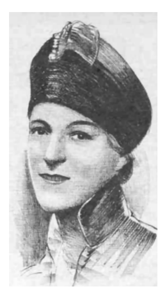
Evelyn May Clowes

English author, widely travelled in Australia and south-east Asia, and resident in Melbourne for 8 years. Numerous novels and short stories.