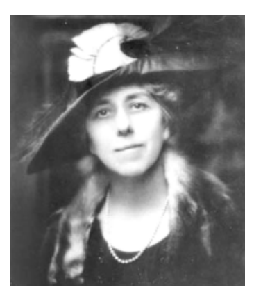
Alice Caldwell Hegan Rice

The American Magazine, Aug 1914 World's News (Sydney) 13 Oct 1917